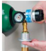
Connections and controls are designed for ease of operation by the patient.